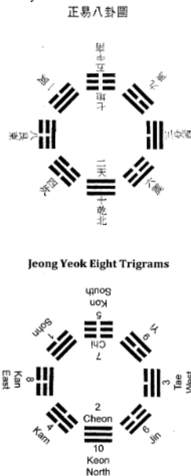
Figure 1 Diagram of the Jeong Yeok Eight Trigrams. The upper diagram is the original diagram and the lower diagram is a translated diagram